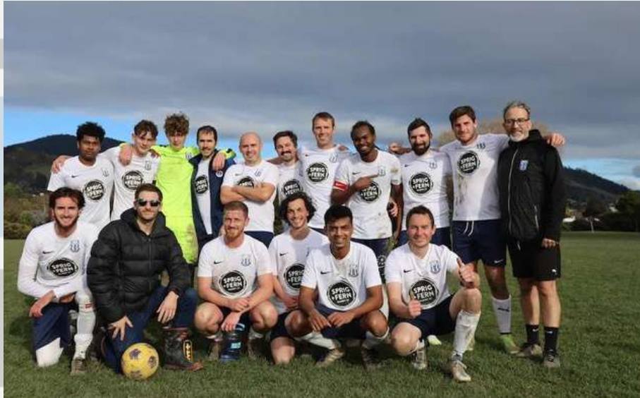
The FC Nelson NMIT team have created a bond that goes deeper than football, with past players still keeping up with the team's antics on and off the field.

Community is at the heart of FC Nelson's NMIT team. Ingrained in everything they do is a sense of brotherhood that transcends the game and welcomes new arrivals into the local community. It's created a lifelong bond between the teammates that has carried on long after they have left, with many more staying around to play.